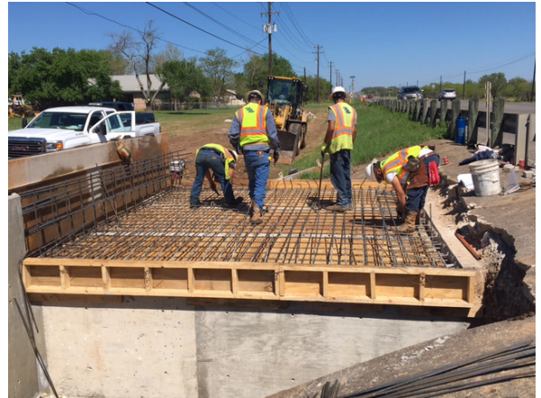
2. Sterling Placing Steel for Proposed Box Culv N of Oyster Creek