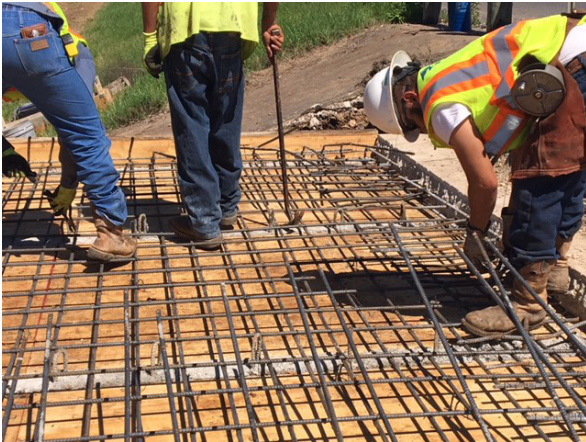
1. Sterling Placing Steel for Proposed Box Culv N of Oyster Creek