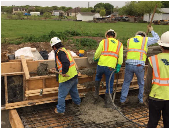
3. Sterling Pouring Wall of Proposed Box Culv N of Oyster Creek