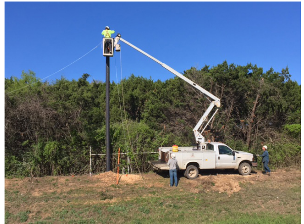
4. Frontier Installing Span Wire N of Mustang Creek