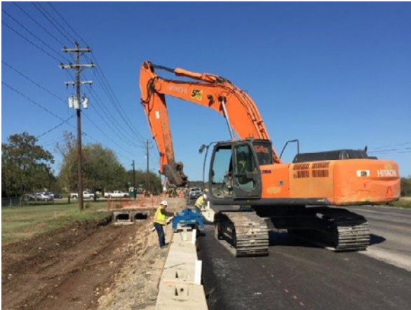
1. Sterling Placing Barrier for Phase 2 at Oyster Crk