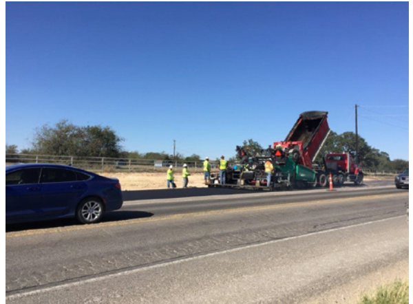
2. Austin Material Paving Temp Widening N of Cole Springs