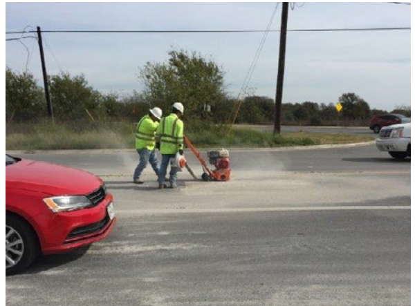
4. TRP Removing Existing Striping at RM 967