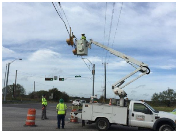
6. Levy Adjust Signals for Phase 2 at RM 967