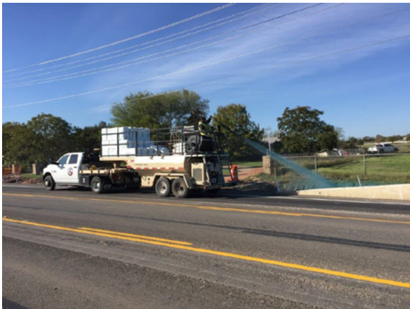
8. RSI Placing Temp Seeding along FM 1626