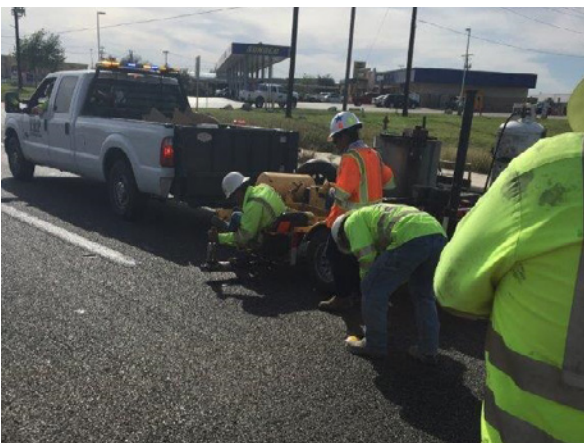
5. TRP Placing Phase 2 Pavement Markers