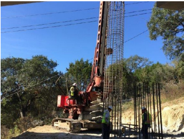
7. Voges Placing Steel for Bent 6 Dilled Shaft at Onion Crk