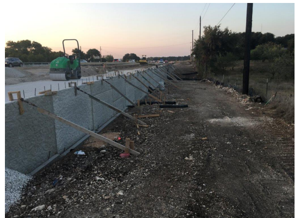
4. Sterling Constructing Retaining Wall N of Onion Crk