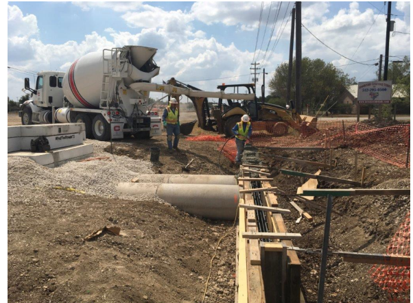
2. Sterling Pouring Headwall for Drainage Culvert N of Hy Rd