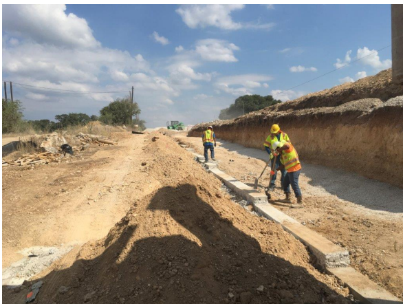
3. Sterling Constructing Retaining Wall at Mustang Crk