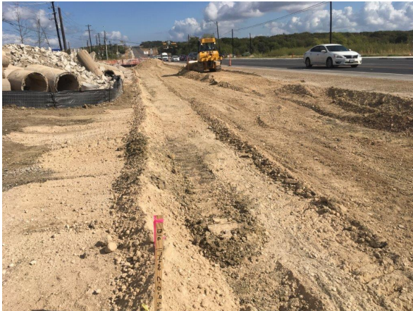
1. Sterling Performing Earthwork Operation S of RM 967